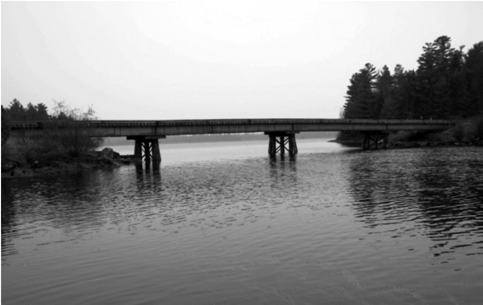
This October 2020 photo shows the Johns Bridge, which spans the Allagash Wilderness Waterway in northern Maine. The bridge was the site in September 2002 of a van accident that killed fourteen migrant workers.

“from away.” In 2002 approximately 1,200 immigrants—mostly from Central America—came with special visas to work for Maine timber companies. Yet it took news of the Allagash tragedy for many Mainers to realize that Central American migrants were living and working among them. 3